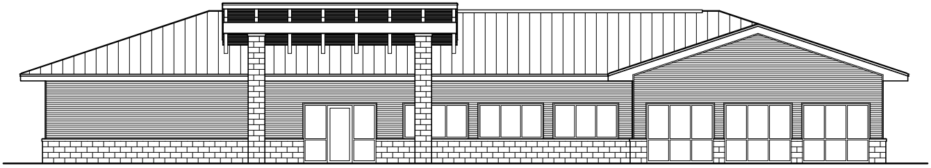
2 WEST ELEVATION 1/16" = 1'-0"